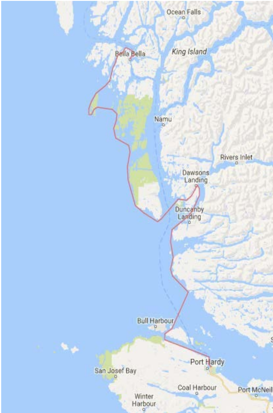
Maps illustrating the proposed route for the Great Bear Rainforest Challenge. The route may vary depending on weather conditions or human factors.